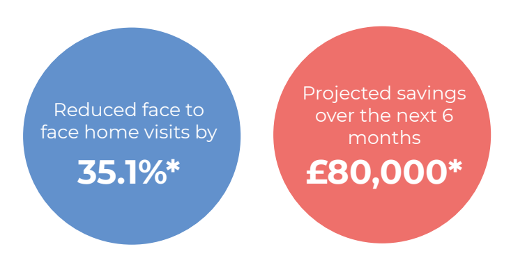
Source: CliniTouch Vie at Leicestershire Partnership NHS Trust - a 6 week report

Spirit Digital and Leicestershire Partnership NHS Trust (LPT) jointly developed an onboarding process, which included the patient set up, identifying each patient's peripheral requirements, the delivery process, and a set up plan for patients.